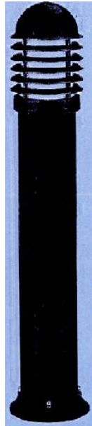
Proposed bollard with cowl (75cm-1m high)